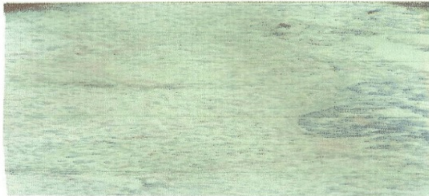
(b) Experimental Ovary