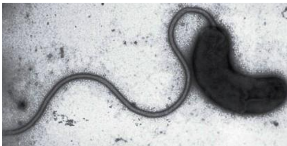
Figure 1. Bdellovibrio bacteriovorus structure [15].