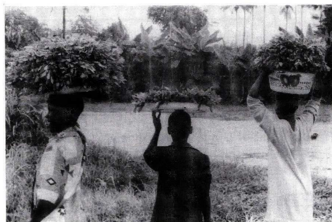
Figure 5. Head transport is used to carry waterleaf to market, Uyo metropolis.