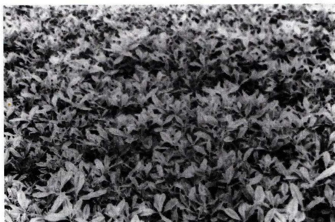
Figure 3. A bed of waterleaf ( T. triangulare ) reaching maturity.

Calcium values were higher in the cultivated soils than the control soils. This was attributed to the organic fertilizers which had been applied. These were usually poultry droppings. Tisdale and Nelson (1975) maintain that calcium is the most significant nutrient in poultry dung. In addition, magnesium and sodium were higher in the market garden soils than the control soils, perhaps