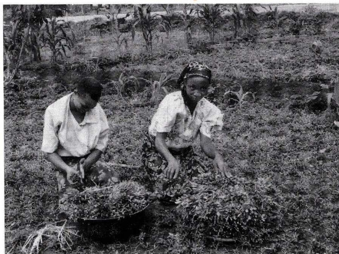
Figure 4. Harvesting of waterleaf. Basins are used as measures of quantity.

of variation in soil properties on crop productivity, standard statistical methods were utilized.